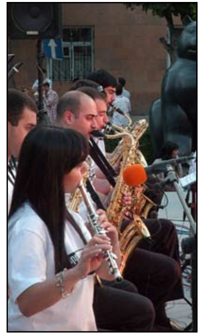
?? ??? ????? ?????????? ?????? ?? ???

He was still furious when he visited a museum of Armenian art objects